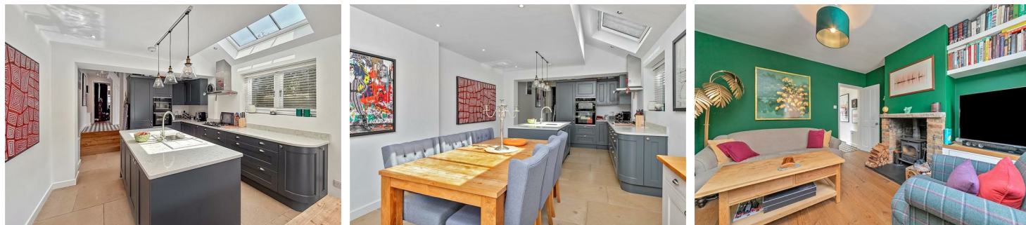
Ground Floor Approx. 603.6 sq. feet

Positioned on the charming Albert Street in St. Albans, this beautifully extended period cottage offers a delightful blend of character and modern living. With three bedrooms and two stylish bathrooms, this cottage is perfect for families or professionals seeking a comfortable and inviting home. Upon entering, you are greeted by a spacious hallway that flows into the heart of the house, being a modern kitchen/diner that offers full entertaining facilities. The fully refurbished interiors boast contemporary finishes while retaining the cottage's original charm, creating a warm and welcoming atmosphere throughout. A further reception room can be found on the ground floor. The landscaped garden is a true highlight of this property, offering a serene outdoor space to unwind or host gatherings. Additionally, the home features a garden gym, providing an excellent opportunity for fitness enthusiasts to maintain an active lifestyle without leaving the comfort of their home. Conveniently located, this property is just a short walk from the city centre and the train station, making it ideal for those who commute or enjoy the vibrant local amenities. With its perfect combination of period features, modern comforts, and a prime location, this cottage is a rare find in St. Albans. Don't miss the chance to make this charming home your own. * The property comes with access to off-street parking*