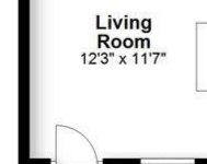
First Floor Approx. 439.6 sq. feet